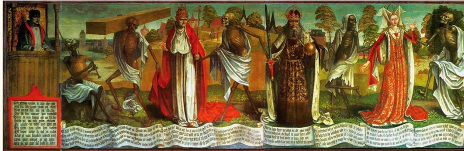
Visual Source 11.3 A Culture of Death St. Nicolai's Church, Tallinn, now the Niguliste Museum. Chapter 11, Ways of the World: A Brief Global History with Sources , Second Edition Copyright © 2013 by Bedford/St. Martin's Page 555