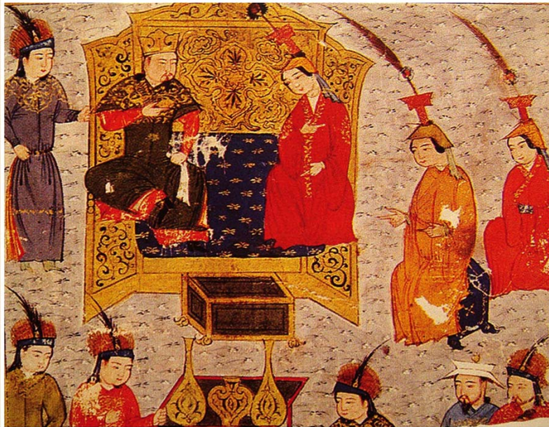
Mongol Rulers and Their Women Bibliothèque nationale de France Chapter 11, Ways of the World: A Brief Global History , Second Edition and Ways of the World: A Brief Global History with Sources , Second Edition Copyright © 2013 by Bedford/St. Martin's Page 372 (page 532, With Sources)