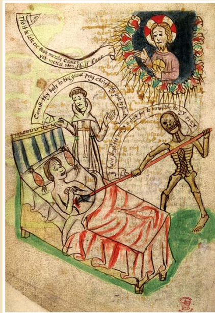
Visual Source 11.4 In the Face of Catastrophe — Questioning or Affirming the Faith Chapter 11, Ways of the World: A Brief Global History with Sources , Second Edition Copyright © 2013 by Bedford/St. Martin's Page 556