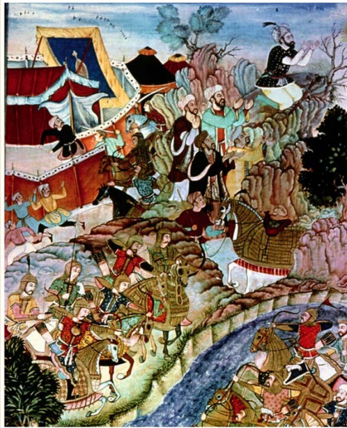
Chinggis Khan at Prayer Chapter 11, Ways of the World: A Brief Global History, Second Edition and Ways of the World: A Brief Global History with Sources, Second Edition Copyright © 2013 by Bedford/St. Martin's Page 352 (page 512, With Sources)

1. Describe this painting. What different kinds of actions are represented here?