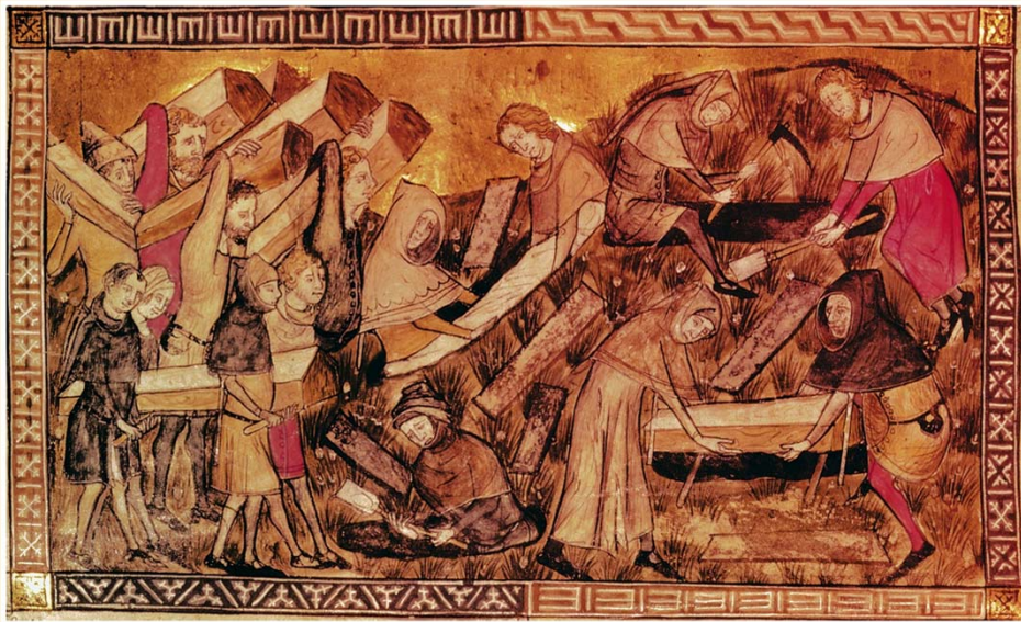
Visual Source 11.2 Burying the Dead Chapter 11, Ways of the World: A Brief Global History with Sources , Second Edition Copyright © 2013 by Bedford/St. Martin's Page 553