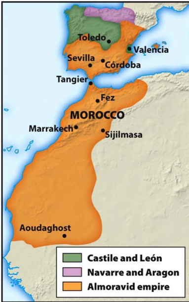
Spot Map The Almoravid Empire Chapter 11, Ways of the World: A Brief Global History , Second Edition and Ways of the World: A Brief Global History with Sources , Second Edition Copyright © 2013 by Bedford/St. Martin's Page 361 (page 521, With Sources )