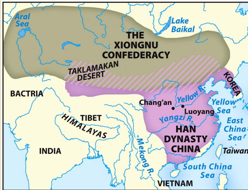
Spot Map The Xiongnu Confederacy Chapter 11, Ways of the World: A Brief Global History, Second Edition and Ways of the World: A Brief Global History with Sources, Second Edition Copyright © 2013 by Bedford/St. Martin's Page 358 (page 518, With Sources)