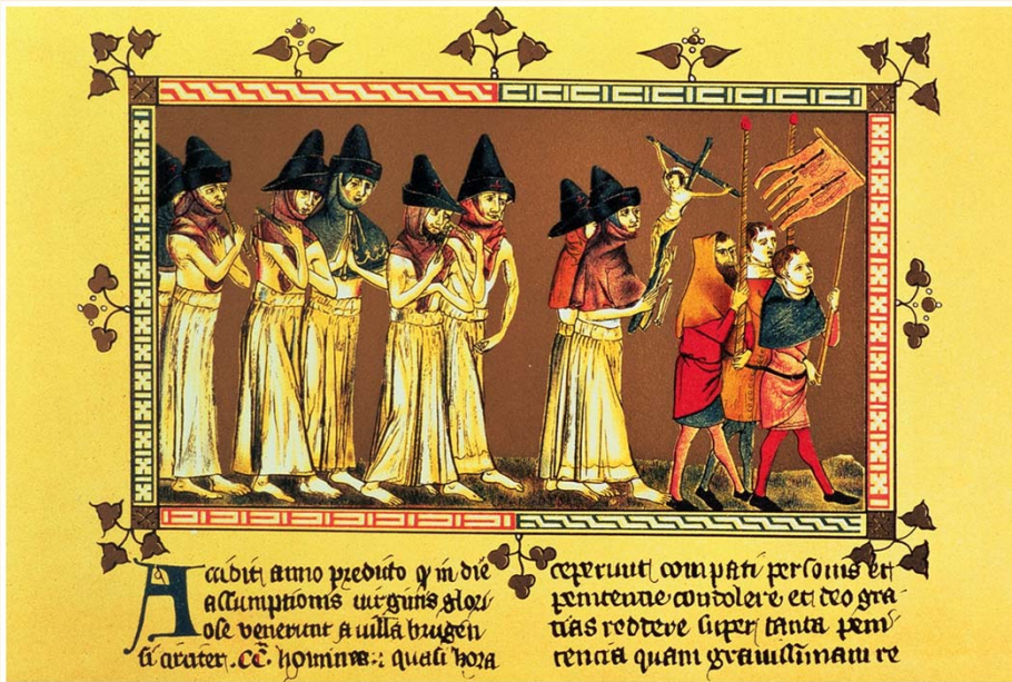
Visual Source 11.1 The Flagellants Chapter 11, Ways of the World: A Brief Global History with Sources , Second Edition Copyright © 2013 by Bedford/St. Martin's Page 552