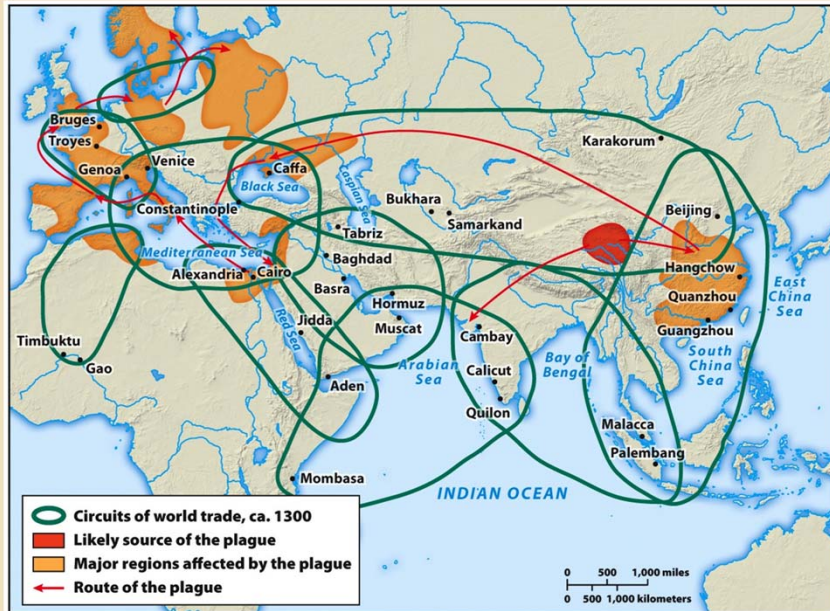
Map 11.2 Trade and Disease in the Fourteenth Century Chapter 11, Ways of the World: A Brief Global History , Second Edition and Ways of the World: A Brief Global History with Sources , Second Edition Page 375 (page 535, With Sources)